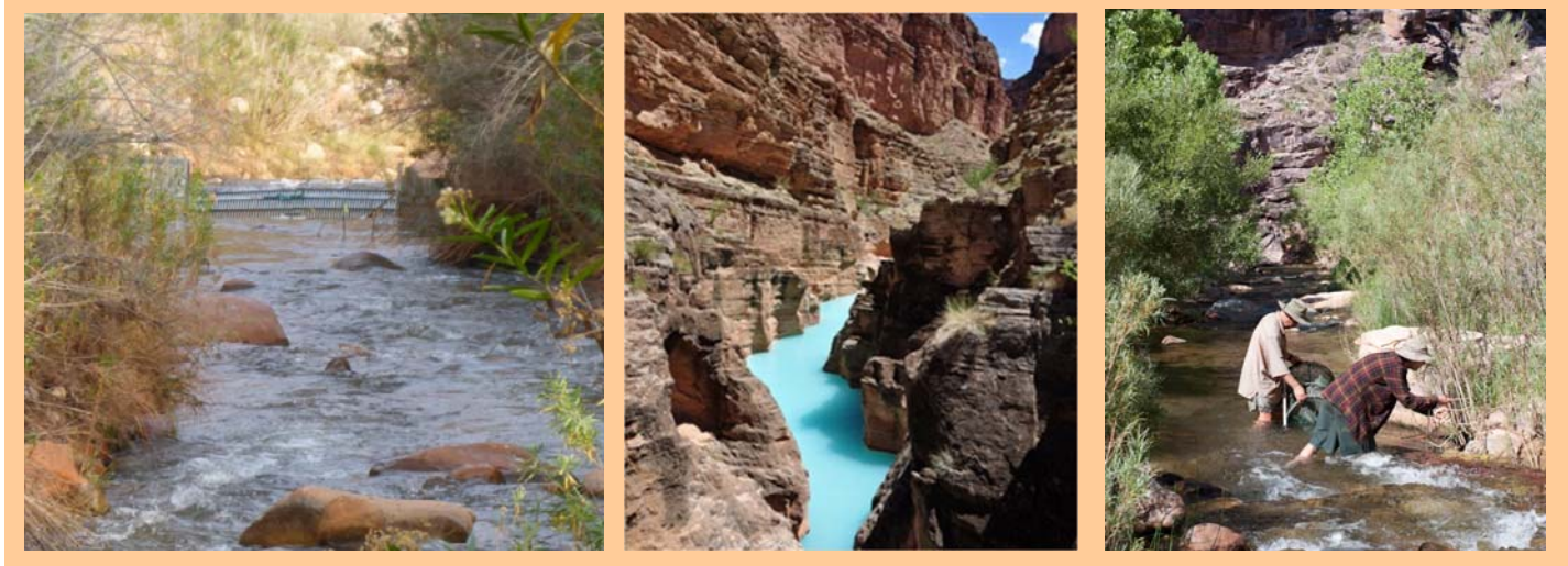
Bright Angel Creek (NPS)